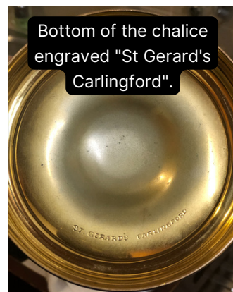
Bottom of the chalice engraved "St Gerard's Carlingford".